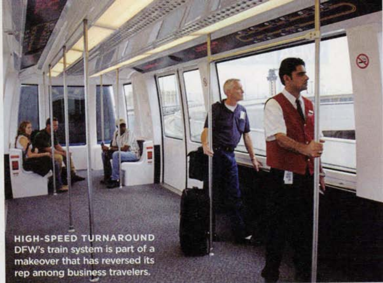
HIGH-SPEED TURNAROUND DFW's train system is part of a makeover that has reversed its rep among business travelers.